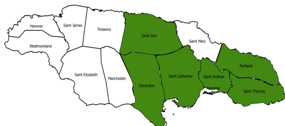
Legend Drought Flood Bushfire Heat Stress No Impact